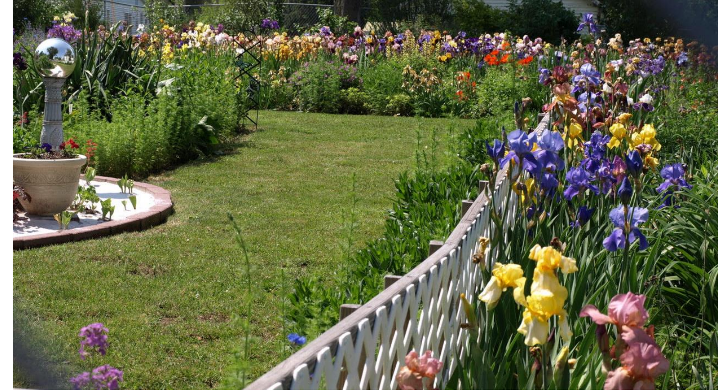
Sterling Howard Garden